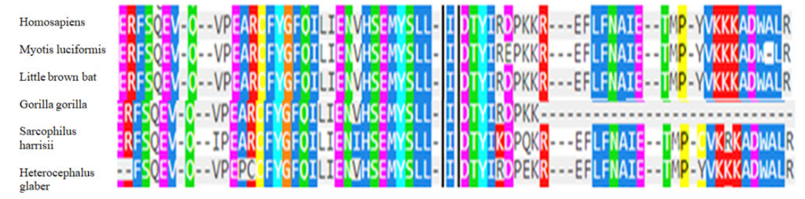
Figure 2. Conservation of RRM2B gene p.Ile 142Thr in exon 4 variant along with flanking amino acids in orthologs domain among species

with peripheral neuropathy and 9/31 cases with areflexia were observed. In our patient, we could not find evidence to support the presence of peripheral neuropathy in EMG, although there was areflexia. Deafness which was present in our patient was found to be related to cochlear pathologies in two other patients by Iwanicka-Pronickaa et al. 9