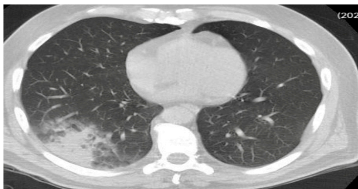
Figure 2. Ground-glass opacity with consolidation in the right lung (admission chest CT)

Common clinical features of reversible splenic lesion syndrome include seizure, confusion and delirium. Accumulating evidence has indicated