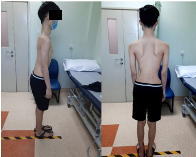
Figure 1: The patient with rigid spine and thin body-built, with loss of normal spinal curvature and minimal scoliosis.

After genetic counselling, the patient was referred for enzyme replacement therapy with intravenous recombinant alglucosidase alfa.