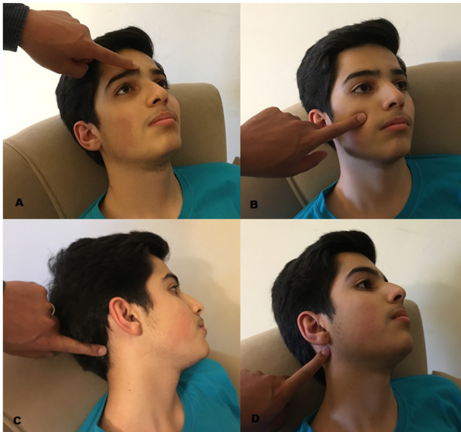
Figure 1. Point of massage in frontalis (A), masseter (B), splenius capitis (C) and sternocleidomastoid (D) muscles.

Participants recorded time of start and stop of each headache episode and its intensity in a diary during week 1 and week 4. Also, the number and the type of analgesic pills used were recorded. The total headache duration for a given day was calculated by summing up the duration of all headache episodes occurring that day.